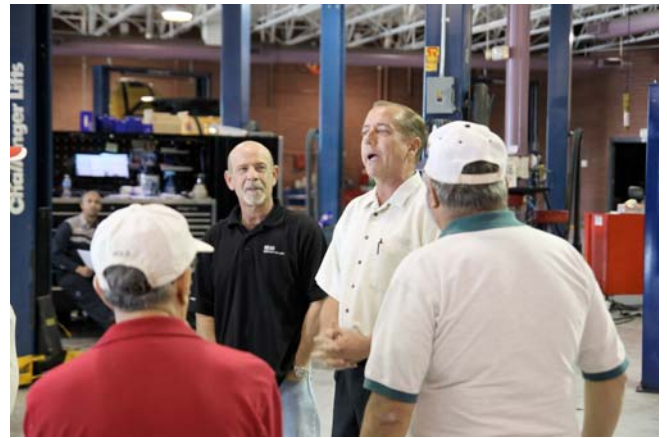
Sanderson staff showing off the service garage.