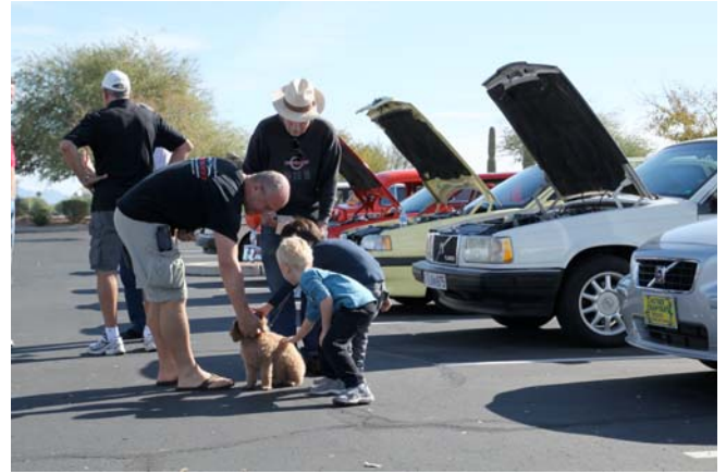
Some Swedish fields enjoy the afternoon.