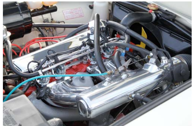
Ken Purcell's under hood shine.