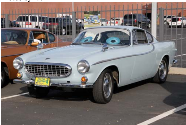
Looking like "Missile McFinn."