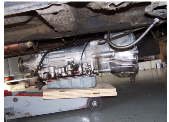
Day 2: Ready to go back in the car