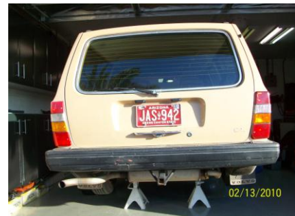
Day 1: Prepared for surgery