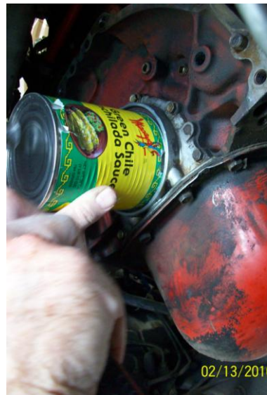
Installing the rear main seal, with spice!