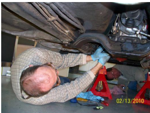
I have you now you bugger!